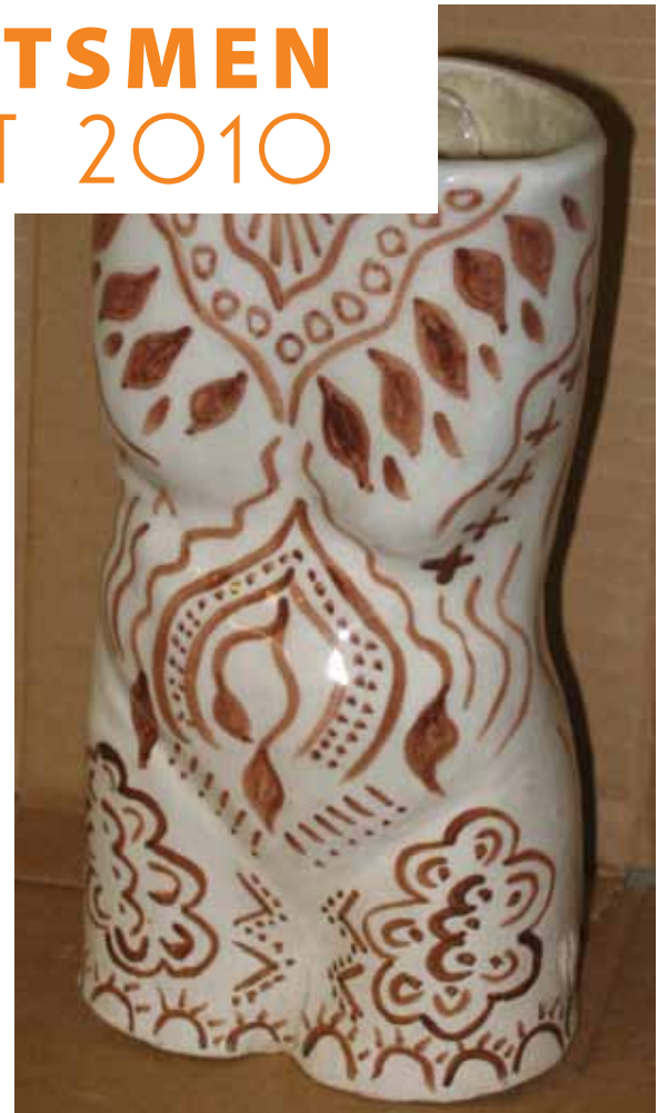
Jere Nelson— Painted clay body