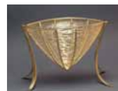
Joy Raskin—Wire Weaving