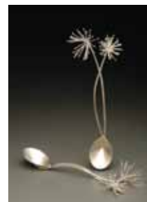
Paulette Werger—Dandelion Spoons