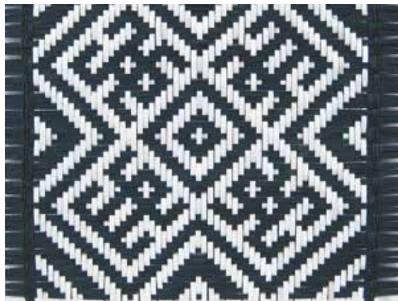
Black Ash Twill —JoAnne Russo