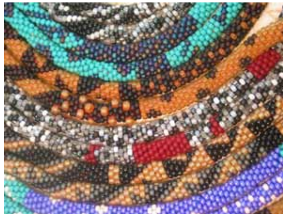
Crocheting with Beads —Sherry St. Germaine