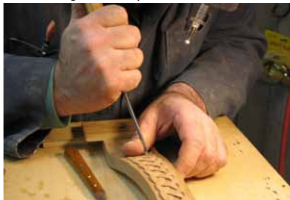
Wood carving —Grant Taylor

Learn ways to transfer pigment to cloth. Using brushes, handwriting, and basic household tools on plastic sheet you'll develop and print your unique mark. Direct painting, stamping, fabric markers, oil pastel transfer, and Shiva sticks will also be covered. You'll start by working on white fabric, then broaden out to use your own patterned, plain, sheer, upholstery fabrics, clothing, whatever! There will be plenty of time for experimentation. Creating yardage is encouraged. This workshop is open to all skill levels and is ideal for Art Majors needing something unique in their portfolio. Sunday is open studio...students from previous classes welcome!